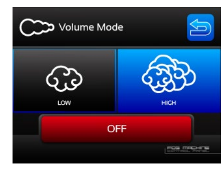
Step 5: To turn off the machine, put the power switch to the OFF position.