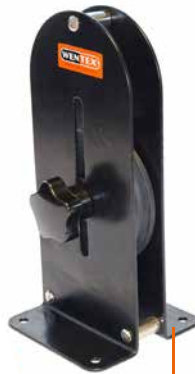
Attachment at the floor