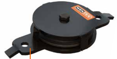
Pulley for attachment above the rail