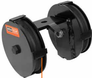
Attachment over the rail