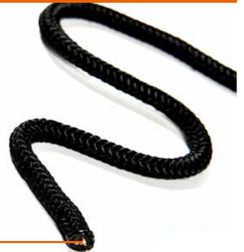
Provided on a roll of 100 m