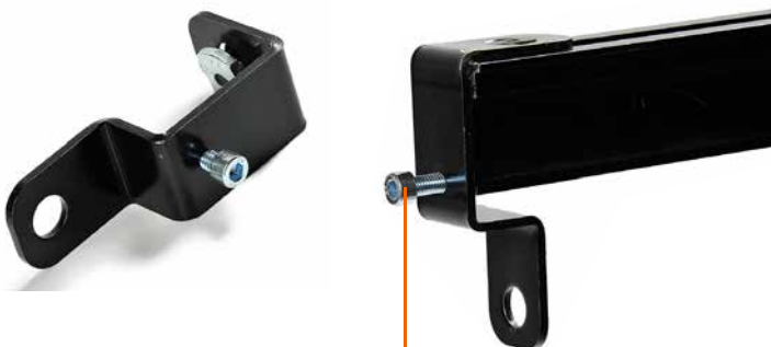
Attachment at the end of the rail so the runners stop